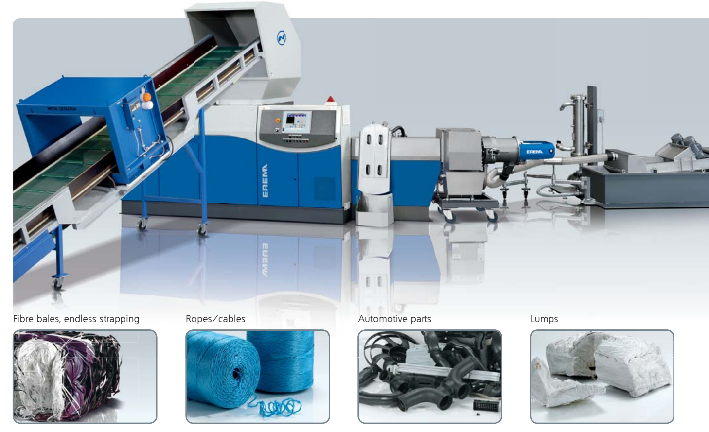
Examples of materials that can be processed